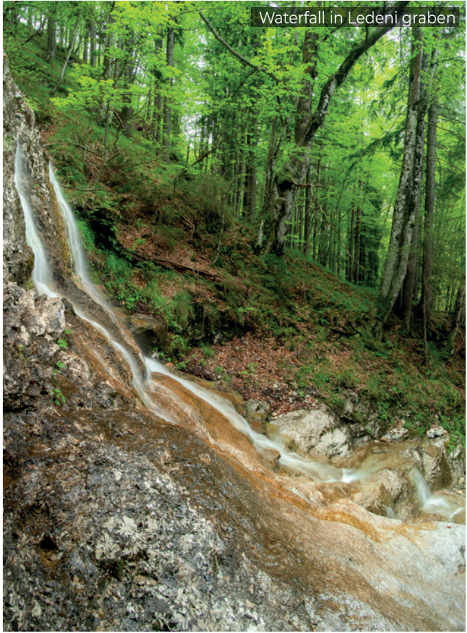
Waterfall in Ledeni graben

To reach the waterfall, follow green-and-white trail markers and direction signs. At the wooden fence, turn left to reach a designated viewpoint for the waterfall.