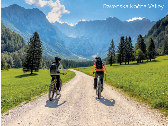
Ravenska Kočna Valley

The walk along the thematic trail in the valley of Ravenska Kočna is one the most beautiful and longest walks in the valley of Jezersko. The trail is well-maintained, marked with signs and equipped with benches. While walking through the valley of Ravenska Kočna, you can observe how the former glacier transformed the surface and how natural forces are changing this unique landscape. The undemanding trail leads along the Jezernica stream through meadows, where a magnificent view of the northern ridges of the Kamnik-Savinja Alps with the highest peak, Grintovec, opens up. On the way, you will learn how this glacial valley was formed, its fauna and flora and all the other attractions that make the valley of Ravenska Kočna worth a visit.