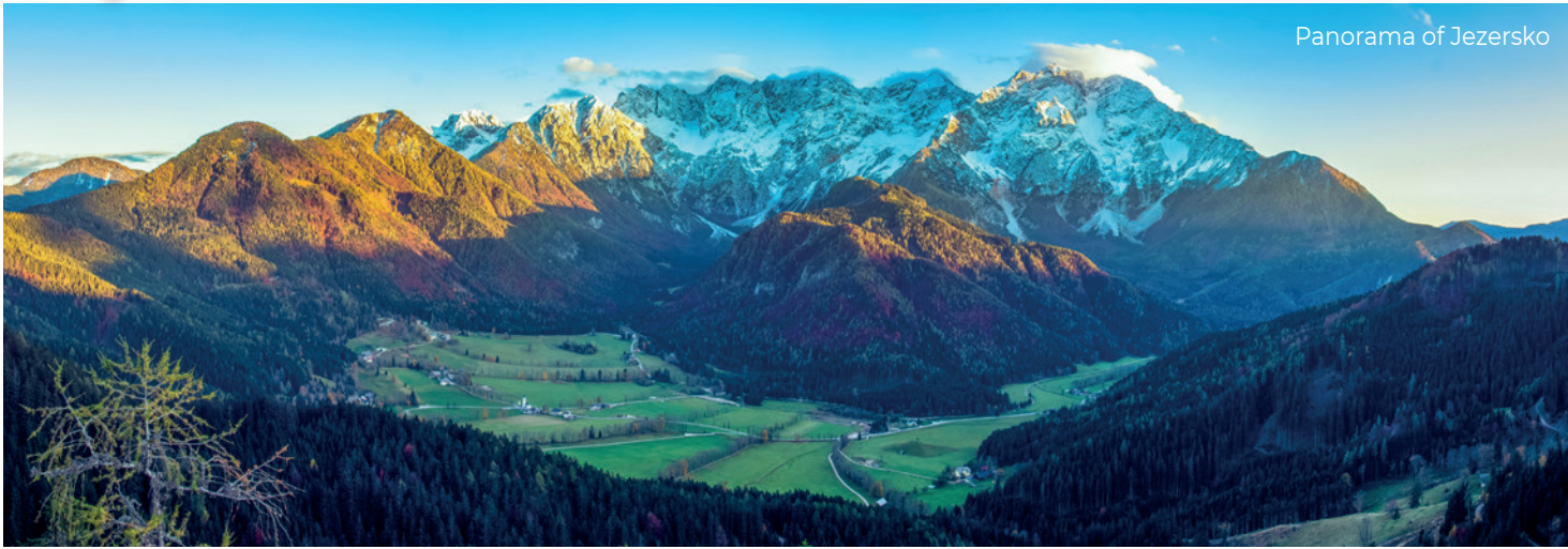
Panorama of Jezersko